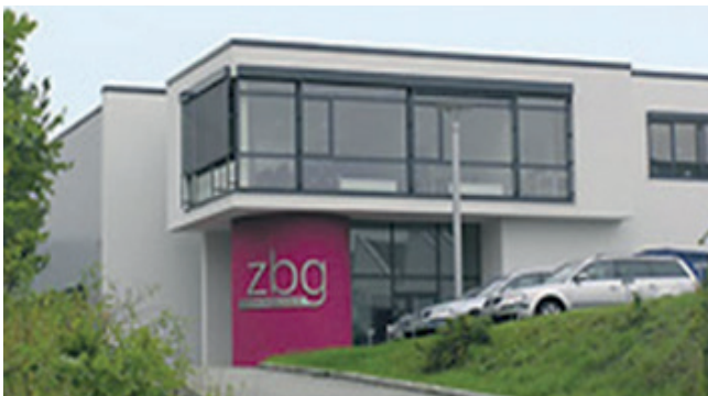
The ZBG Zerspanungstechnik HQ, Bruck, Germany.

Due to those principles, the choice of Rotary Tables in the Company's early years was NIKKEN and this remains so today."