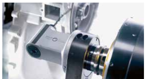
Alberti Angle Heads