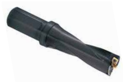
Combat Z Drill