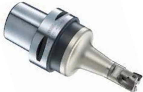
Major Dream Pro-Endmill