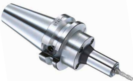
Mini Mini Chuck Advanced