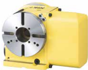
4 th Axis Rotary Tables