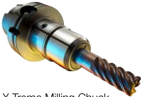
X-Treme Milling Chuck