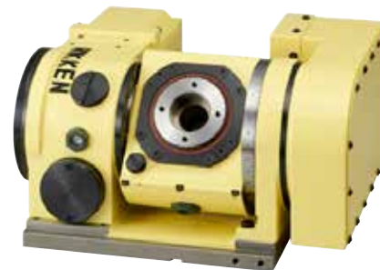
5 th Axis Rotary Tables