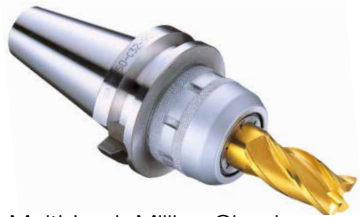
Multi-Lock Milling Chuck